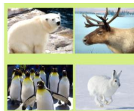
Animals from cold countries