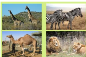
Animals from hot countries

Animals adapt to their climate. For example, a camel does not sweat and can drink lots of water, while polar bears and penguins are able to keep warm because they have blubber (a layer of fat) inside their skins.