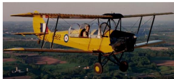
The Tiger Moth is a 1930s British plane operated by the RAF. They were used during World War II as trainer aircrafts, surveillance planes, in defence operations and sometimes as armed light bombers.