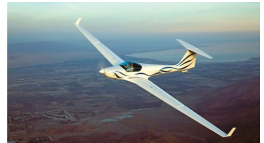
A glider plane is a plane which doesn't depend on an engine. Instead, they use the reaction of the air against its lifting surfaces.