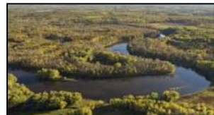
The Mississippi River