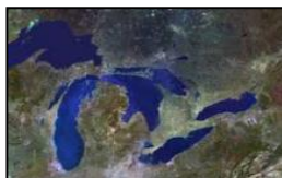
The Great Lakes