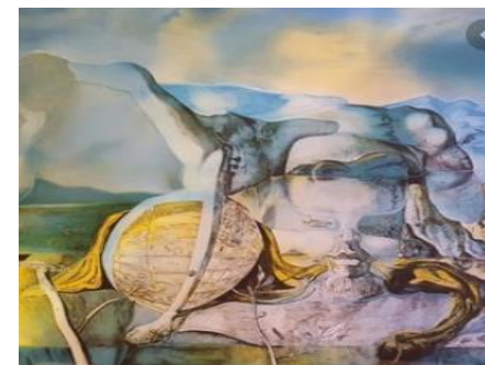
'L'enigma san fin' 1930