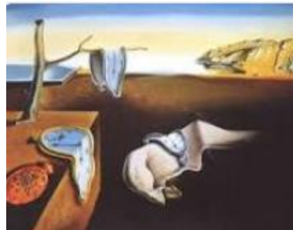
'The Persistence of Memory' 1931