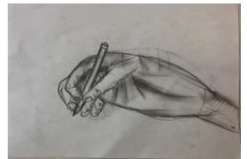
Year 6 art