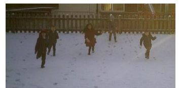
Children in school playing in the snow!