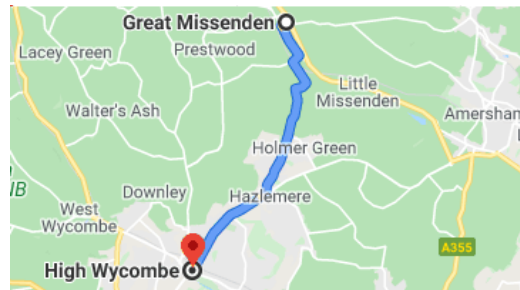
The Roald Dahl Museum