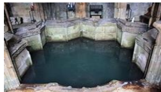
Inside the Gurdwara