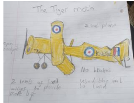
Tiger Moth Diagram

When the children return they will be taught the key skills in Reading, Writing and Maths and take part in weekly PE, Metacognition and Learning For Life lessons.