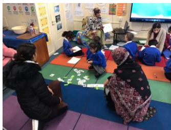
Key Stage 1