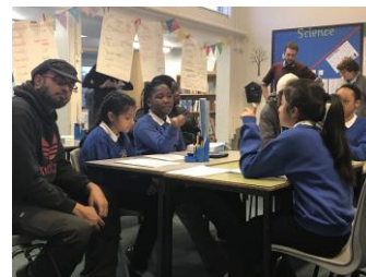
Key Stage 2