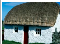
Cottage with a thatched roof