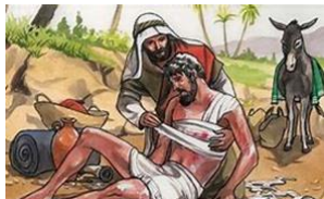
The parable of the Good Samaritan